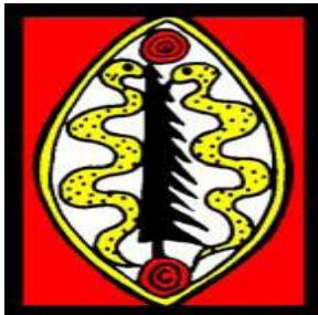
Aboriginal Legal Rights Movement Inc