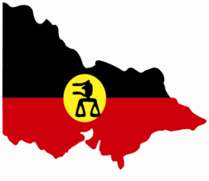
Victorian Aboriginal Legal Service Co-operative Ltd