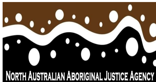
NORTH AUSTRALIAN ABORIGINAL JUSTICE AGENCY