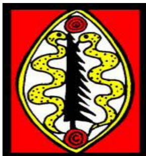
Aboriginal Legal Rights Movement Inc