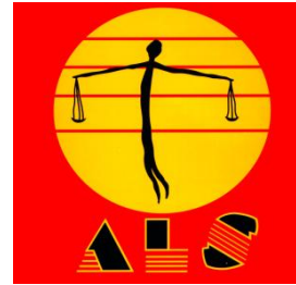
Aboriginal Legal Service of Western Australia