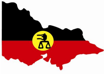
Victorian Aboriginal Legal Service Co-operative Ltd