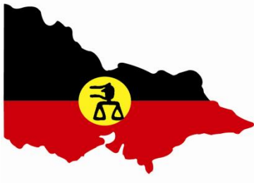
Victorian Aboriginal Legal Service Co-operative Ltd