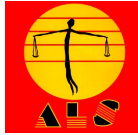
Aboriginal Legal Service of Western Australia