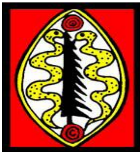
Aboriginal Legal Rights Movement Inc